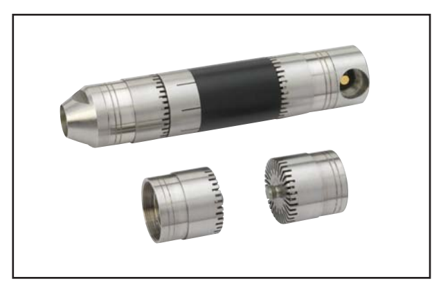
Fig. 1 Intensity-microphone Pair Type 40GK with adapters and a spacer. Below: Intensity-microphone Pair Type 40GI

These intensity microphones are part of G.R.A.S.' full range of condenser microphones. They are a recent generation of precision measurement microphones with improved performance and long term stability. Their design is based on more than 40 years of experience and utilizes the advantages of new high-tech materials and machining techniques. They comply with the requirements of the international standard IEC 1094 Measurement Microphones, Part 4: Specifications for working standard microphones and their mounting threads (11.7 mm 60 - UNS-2) are compatible with all the usual available makes of measurement-microphone preamplifiers.