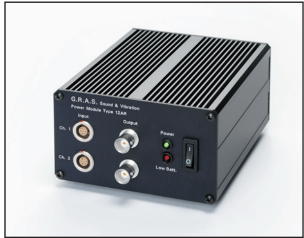
Fig. 1 Power Module Type 12AR

The inputs are two 7-pin LEMO sockets on the front panel, which are wired up (see Fig. 2) for G.R.A.S. microphone preamplifiers, e.g. Types 26AB, 26AC,