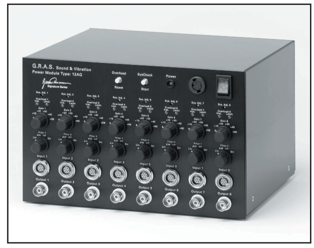
Fig. 1 8-channel Power Module Type 12AG

The input to each channel is a 7-pin LEMO socket