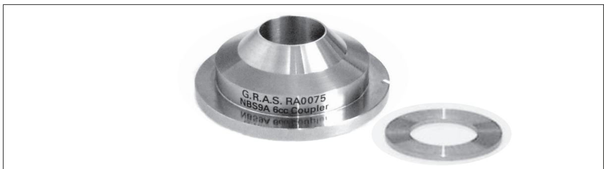
Fig. 1. NBS 9A Coupler RA0075 as delivered